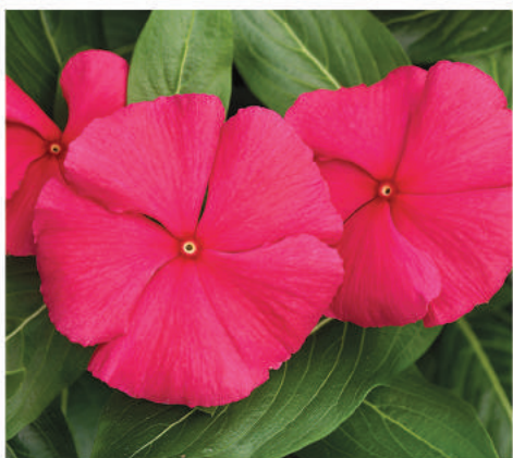
• Cora Punch