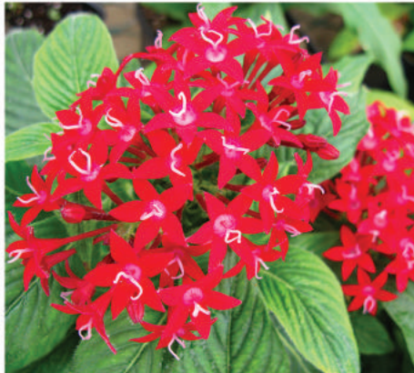
• Bright Red

Known as the dwarf series, these smaller pentas are ideal as a 4.5" plant. They grow to typically 12"-15" but have the same colors and butterfly attractant qualities.