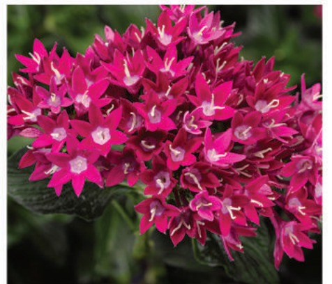
• Monarch Violet