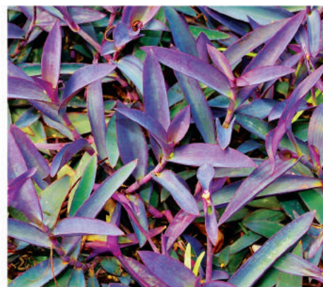
• Setcreasea Purple Queen