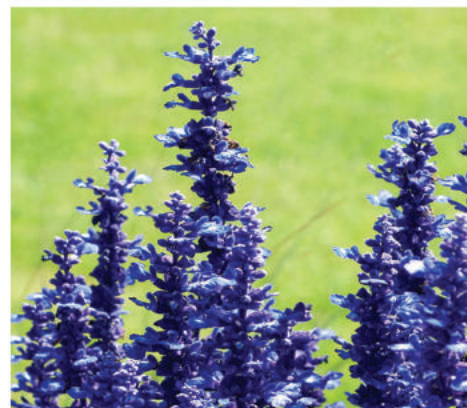
• Moonlight Candle