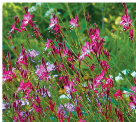
• Pink Gaura