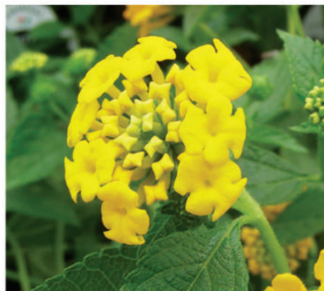
• New Gold Lantana