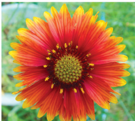
• Orange Gallardia