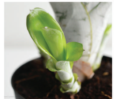
• Bromeliad Pup