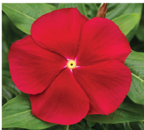
• Cora Red