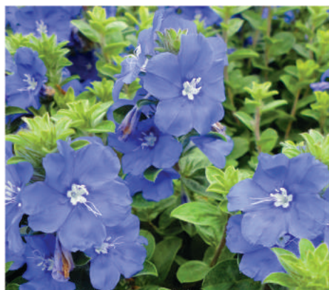
• Blue My Mind Evolvulus

These noteworthy plants have been successfully tested and can be used in several different combinations or on their own as a mass planting.