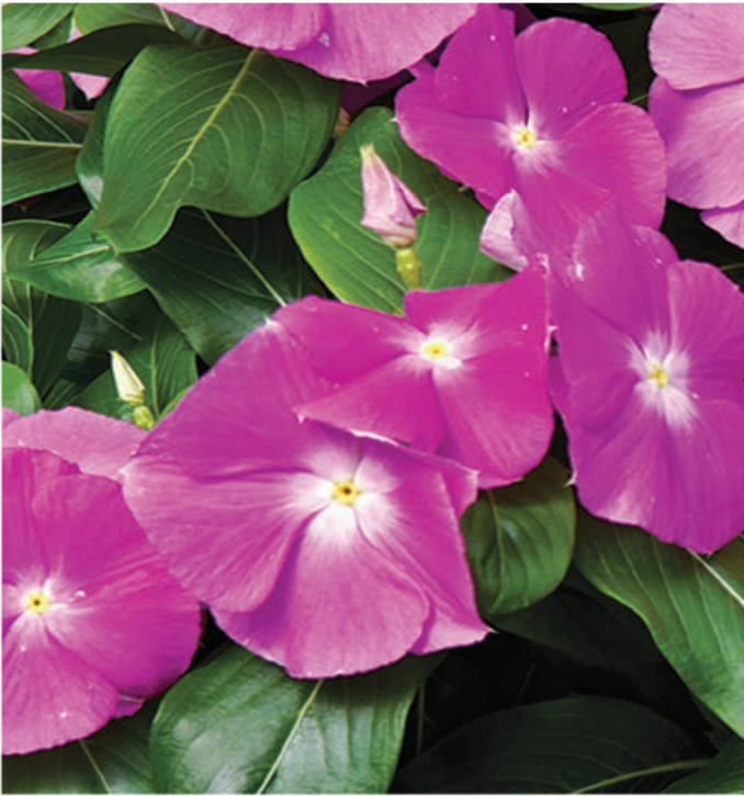
• Cora Deep Lavender