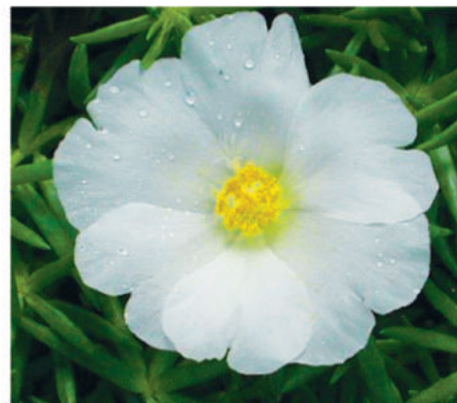
• Samba White