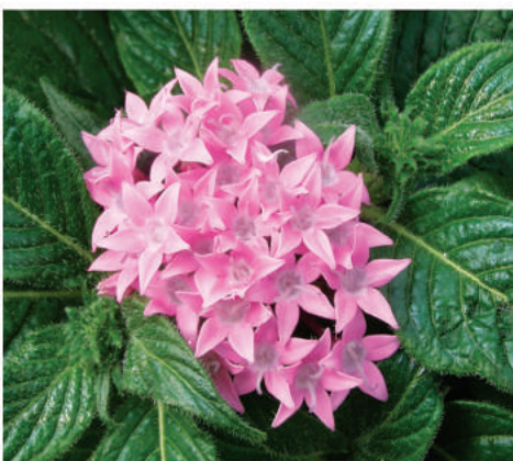
• Butterfly Pentas