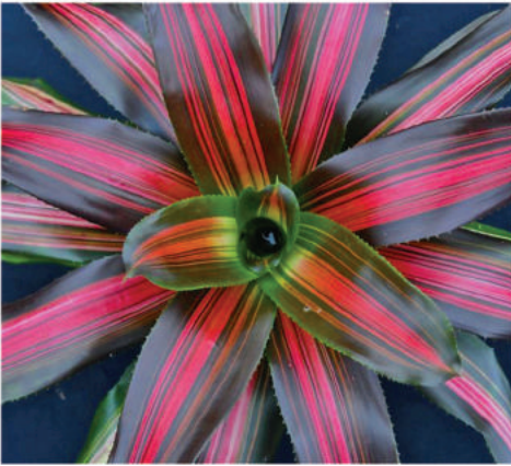
• Neoregelia Cookie