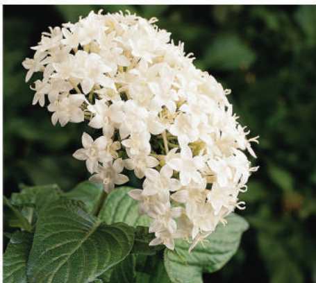
• Butterfly White