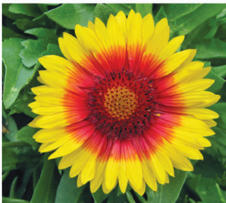
• Bi Color Gallardia