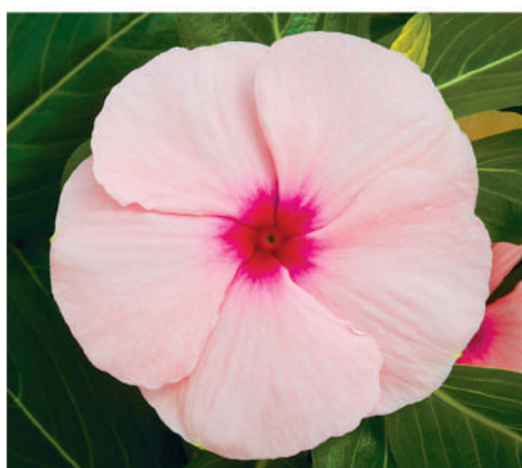
• Cora Apricot