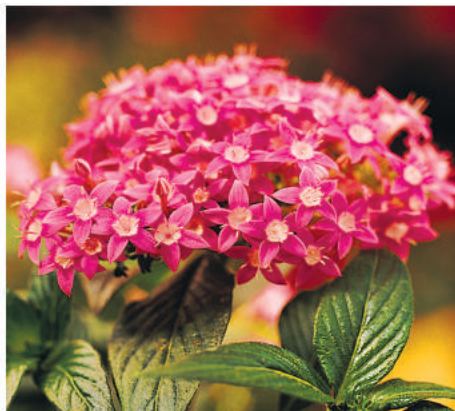
• Butterfly Deep Pink

Pentas prefer full sun and to be very well watered. Butterfly and hummingbirds are attracted to this plant. They grow to be about 18"-24".