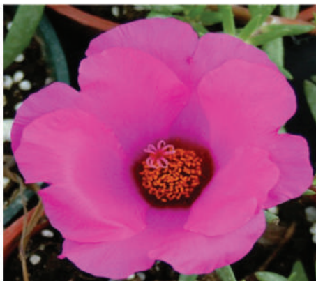
• Samba Rose