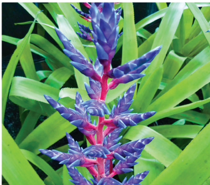
• Blue Tango

Bromeliads provide a unique tropical flair to any environment. Bromeliads boast countless varieties, some can handle full sun, others almost full shade. Certain varieties provide a desirable flower stalk such as Blue Tango, however most bromeliads will only flower once in their lifetime. Bromeliads will reproduce by sending off smaller "pups" from its base.