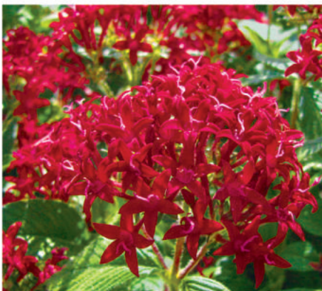
• Red Lace