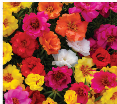
• Happy Hour Mix

This plant has bright blooms and spreads well. It tolerates almost any soil condition as long as it has good drainage. Extremely drought tolerant. It is also photosensitive so on cloudy days the blooms only partially open.