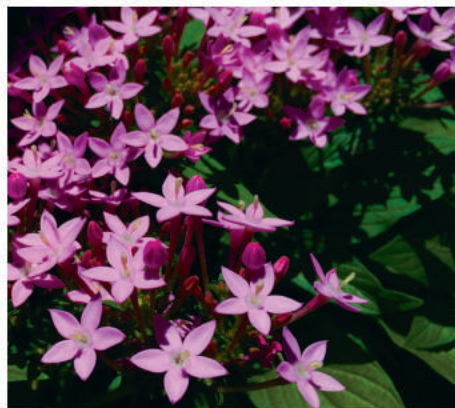
• Northern Lights