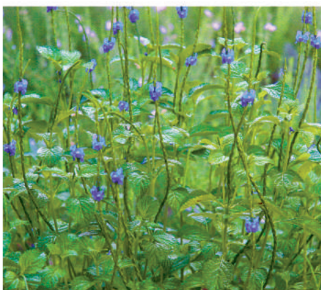
• Blue Porterweed