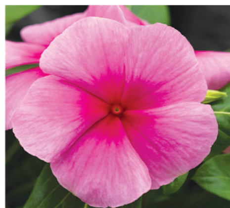
• Cora Strawberry