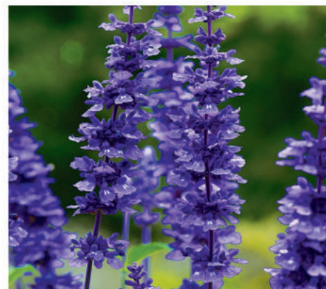
• Mystic Spires

Salvia is a butterfly attractant that can be used all year long. They prefer partial sun and can grow to 18"-36". They are heat and drought tolerant and are an easy plant to grow.