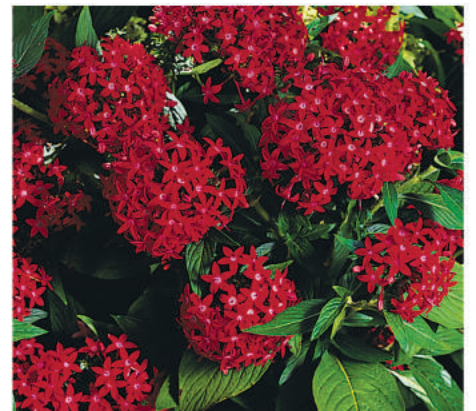
• Butterfly Red