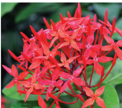
• Ruby Glow Pentas