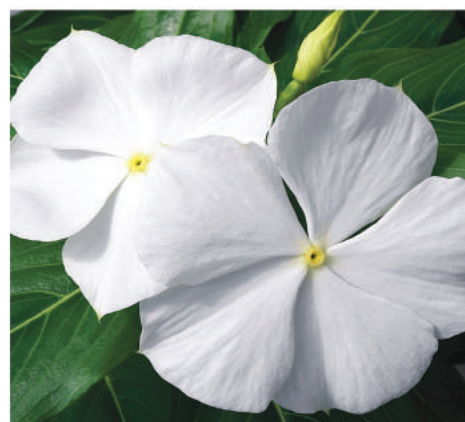
• White Queen