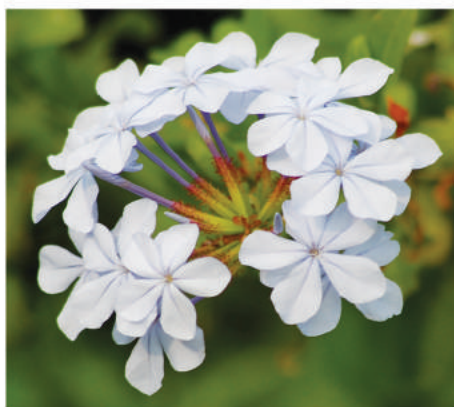
• Plumbago White