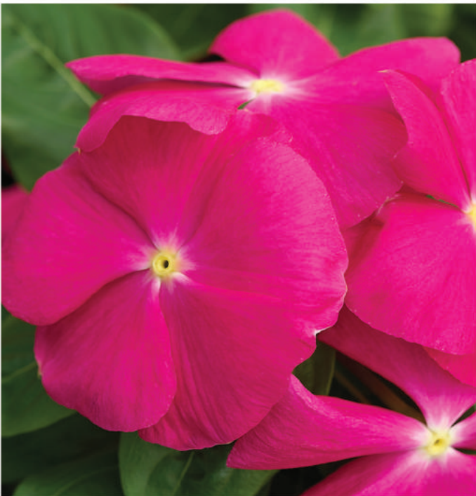
• Cora Pink