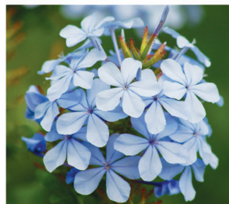
• Plumbago Blue