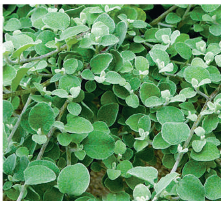
• Helichrysum White Licorice