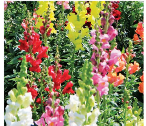
• Sonnet Mix