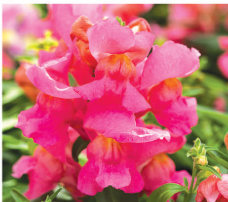
• Montego Pink

This flower requires full sun, average amount of water and also prefers a cooler environment but tolerates a light frost. This dwarf variety reaches 6"-10".