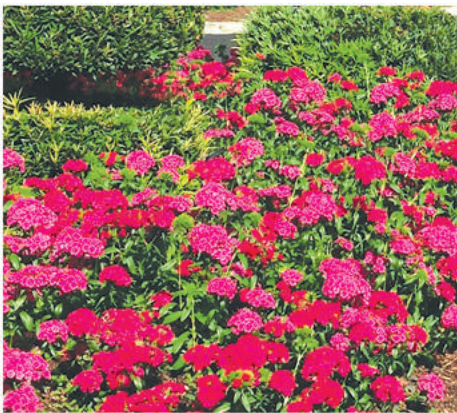
• Dianthus Jolt

These are some plants that have become increasingly popular to use in the Fall/Winter season. Your landscape will be bursting with color!