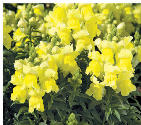
• Montego Yellow