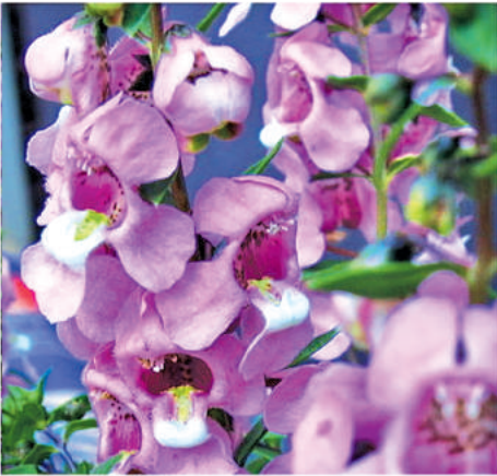
• Sonnet Lavender