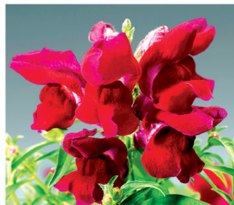
• Montego Red