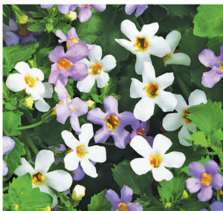
• Bacopa White & Purple