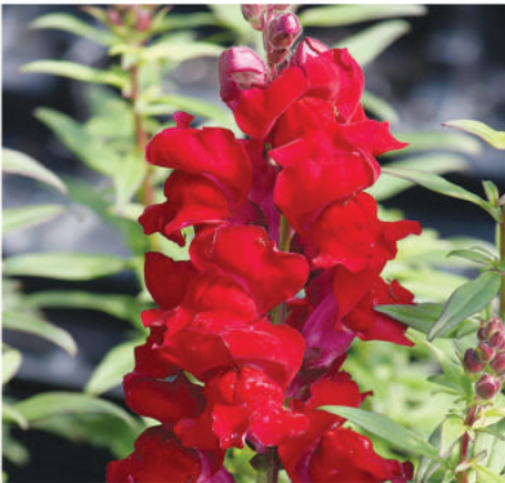
• Sonnet Red