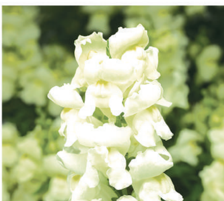
• Montego White