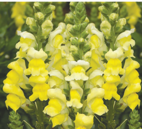
• Sonnet Yellow