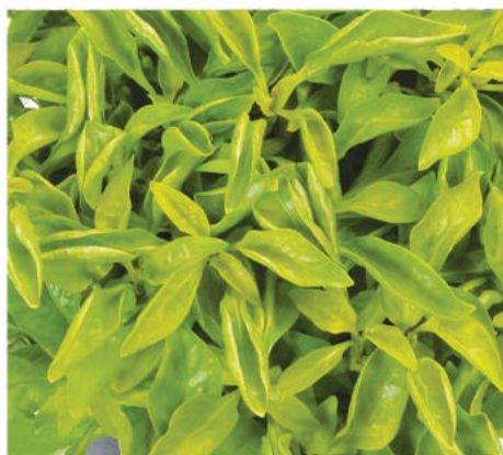
• Alternanthera True Yellow

Inquire about the different species that are not listed for more beautiful options.