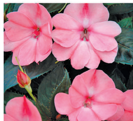
• Blush Pink

SunPatiens have a proven reputation for outstanding performance in the garden and commercial landscapes. Benefit from their full-sun to shade versatility, strong vigor and continuous flower production. Protection from frost is vital to keep the plant growing.