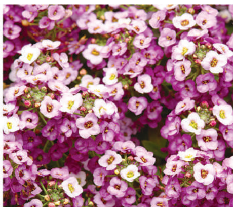
• Purple Alyssum