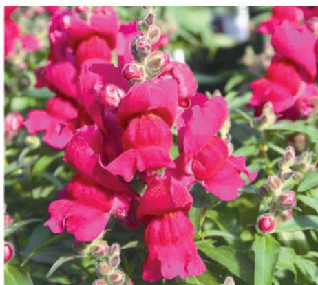
• Montego Violet