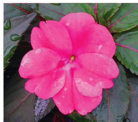
• Deep Rose