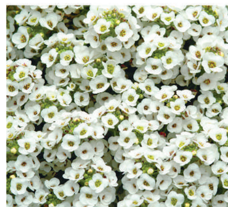
• White Alyssum

Border plants/accent plants are used in combination with other fall annuals. They accentuate the planting area when used in the correct color combinations. There are many options available.