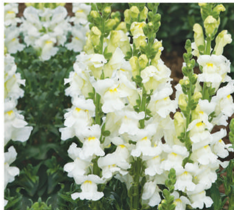
• Sonnet White