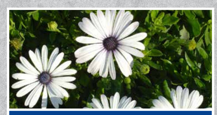
Blue Eyed White