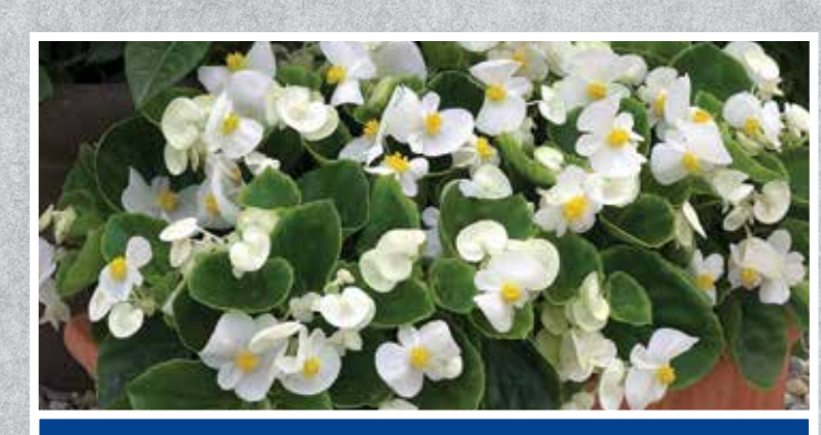
Green Leaf White